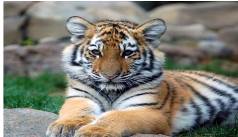
A tiger is a mammal.