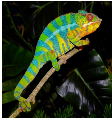
A chameleon is a reptile.

I know that animals can be omnivores - they eat plants and animals.