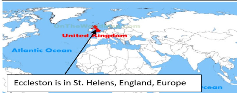
Eccleston is in St. Helens, England, Europe

Eccleston is a residential area of St Helens. The equator is the warmest part of the Earth.