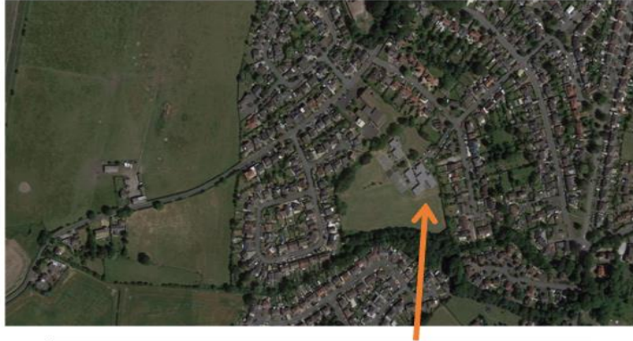
St Julie's School, Eccleston St Helens.

St Julie Primary School is in Eccleston.