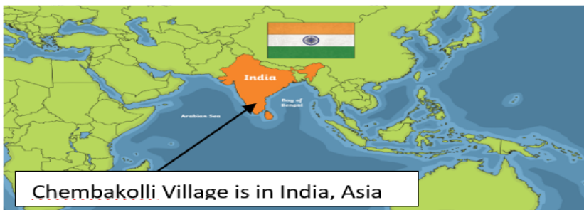
Chembakolli Village is in India, Asia