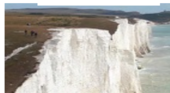
The White Cliffs of Dover