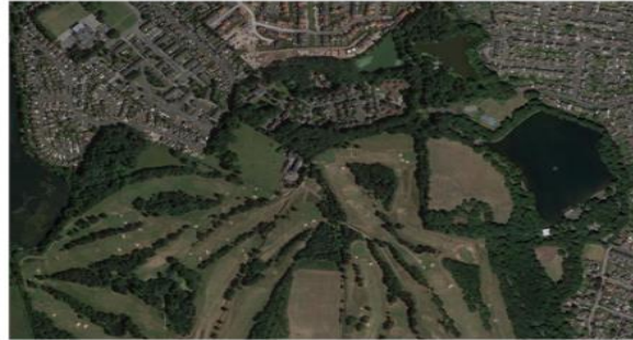
Taylor Park, Eccleston, St Helens.