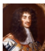
King Charles II