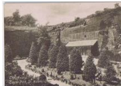
Taylor Park Quarry