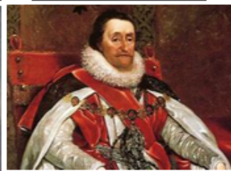
King James I